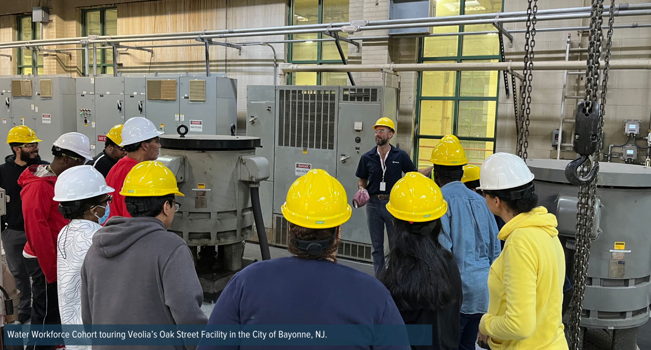
Water Workforce Cohort touring Veolia's Oak Street Facility in the City of Bayonne, NJ.