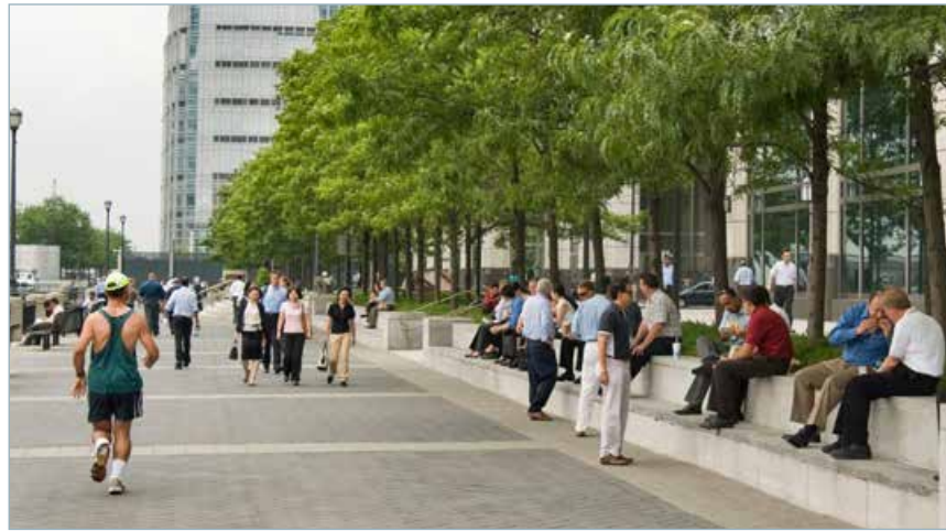
The Hudson Riverfront Walkway in Jersey City provides recreational opportunities and waterfront access for residents, employees and visitors, and serves as a segment of the 2,900 mile East Coast Greenway, which is currently under development.

Thirty years later, the Jersey City waterfront bears no resemblance to the barren mudscape that Wiseman remembers. Sitting in his new waterfront office, 17 stories above the Hudson overlooking the New York and Jersey City skylines, Wisemann lists the elements that comprise Newport's success: 4,870 residential units, 618 hotel rooms, and 4.4 million square feet of office space across 46 buildings; 13.5 acres of parks; and 1.2 miles of the Hudson River Waterfront Walkway. According to Newport Associates Development Company, Newport's residents earn an average annual income of $116,000. The neighborhood