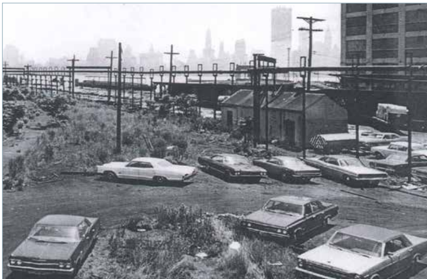
The decline of rail commerce on the Jersey City waterfront left the neighborhood that would later become known as Newport underutilized. The infusion of $75 million in grants and financial assistance for site preparation and infrastructure replacement subsequently catalyzed redevelopment in Newport.

LeFrak Organization was able not only to create an entire mixed-use community but also to provide the necessary foundation for the successful redevelopment of the entire waterfront area.