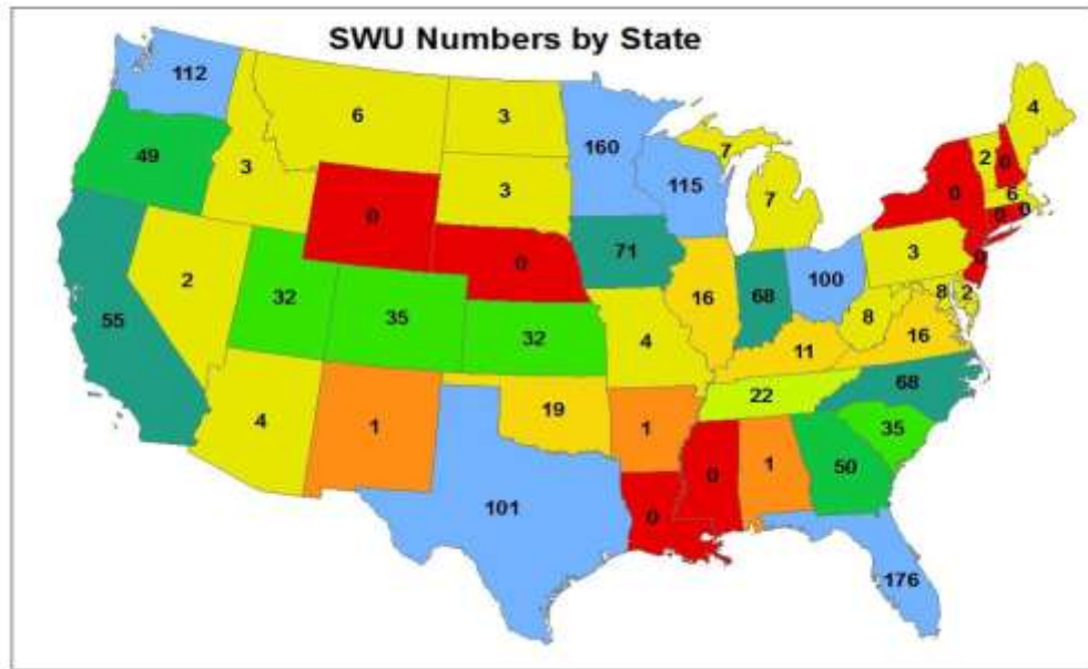
Figure 3. Number of stormwater utilities by state. Blue designates those states with more than 100 and red indicates those with no stormwater utilities. Despite have younger development than New Jersey, Minnesota, Florida, and Wisconsin are the leaders in implementing stormwater utilities.

Minnesota. 27 Stormwater utilities can provide municipalities with the resources necessary to responsibly maintain and manage existing systems.